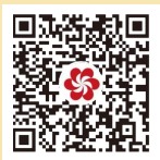
QR Code for Overseas Buyer Pre-registration

For your convenience and to save your time, overseas buyers are encouraged to pre-register, collect Buyer Badge in advance and at alternative places rather than at the Canton Fair Complex. Before arriving the Complex, overseas buyers can collect Buyer Badges for free at alternative registration offices such as Guangzhou Baiyun International Airport and designated hotels in Guangzhou after pre-registration. Scan the following QR code for pre-registration and news update of the Fair. For the latest information, please refer to the Canton Fair's official website.